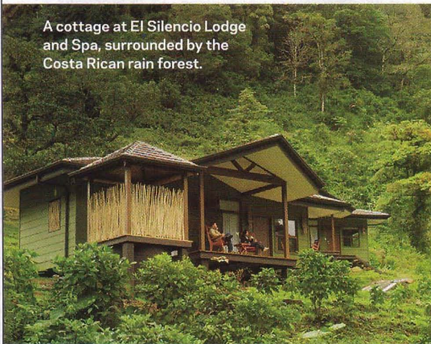
A cottage at El Silencio Lodge and Spa, surrounded by the Costa Rican rain forest.