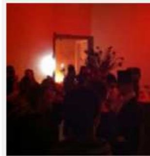
Secret Berlin salon party

government buildings of the GDR, bank vaults, old power stations, etc., many stay open all night and involve various degrees of scandalous behavior—this is Berlin, after all. To gain strength for the nightcrawling, he might start off at one of Berlin's increasingly sophisticated new restaurants—a recent favorite was Volt, also located in a former power station in Kreuzberg and featuring a creative, pan-European menu. 350 Euros for 3 1/2 hours—more if you decide to go on all night. henrik@berlinagenten.com , http://www.berlinagenten.com/